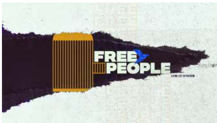
4 WEEKS ON AUTHORITY