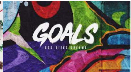
4 WEEKS ON WISDOM