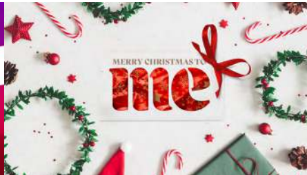
4 WEEKS ON CHRISTMAS