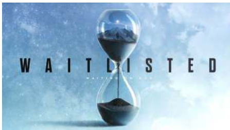
4 WEEKS ON DOUBT & QUESTIONS