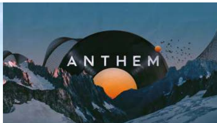
4 WEEKS ON WORSHIP