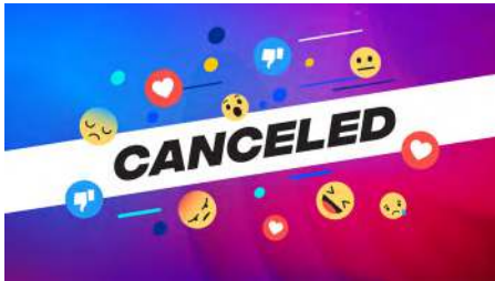
4 WEEKS ON LOVING OTHERS