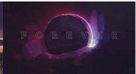
2 WEEKS ON EASTER