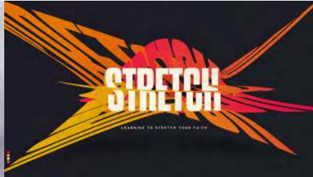
4 WEEKS ON SPIRITUAL HABITS