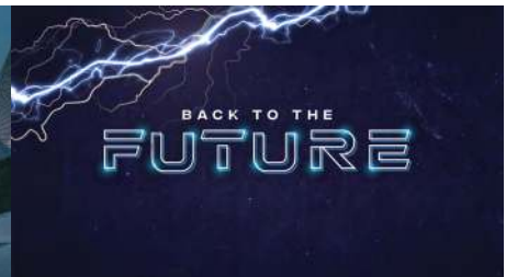
4 WEEKS ON JUSTICE