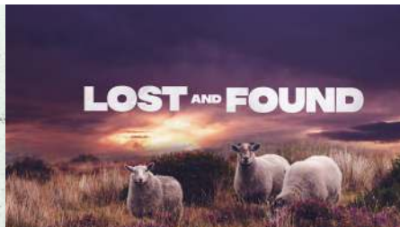
4 WEEKS ON JESUS