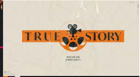
4 WEEKS ON IDENTITY