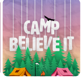
4 WEEKS ON JESUS' EARLY LIFE AND MINISTRY