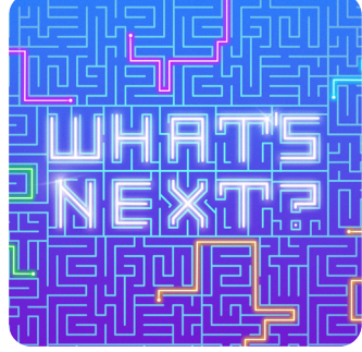
4 WEEKS ON THE EARLY CHURCH