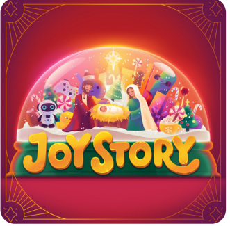
5 WEEKS ON CHRISTMAS