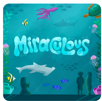
4 WEEKS ON JESUS' MIRACLES