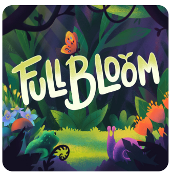
4 WEEKS ON EASTER