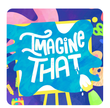
4 WEEKS ON ELISHA