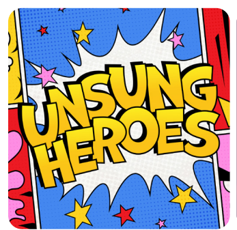
4 WEEKS ON RUTH