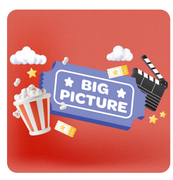
5 WEEKS ON JESUS' TEACHINGS