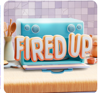
5 WEEKS ON ELIJAH