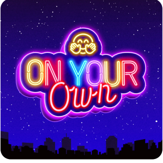
4 WEEKS ON FRIENDSHIP