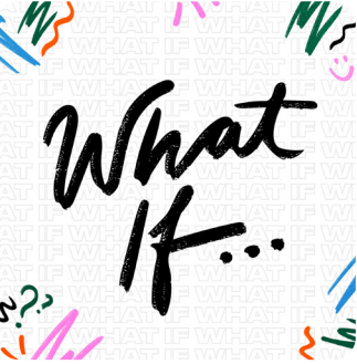
4 WEEKS ON JUSTICE