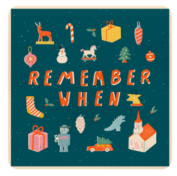
4 WEEKS ON CHRISTMAS