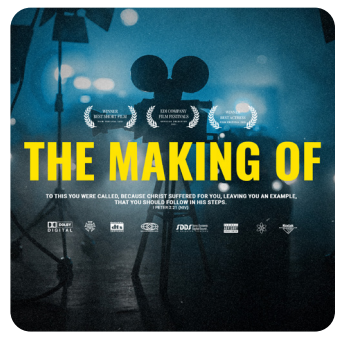
4 WEEKS ON SPIRITUAL GROWTH