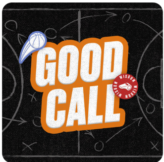
4 WEEKS ON WISDOM