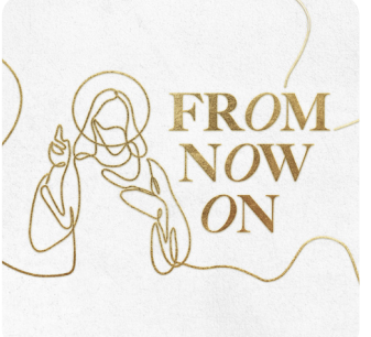
4 WEEKS ON JESUS