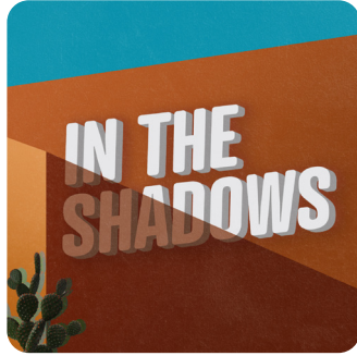
4 WEEKS ON DOUBT & QUESTIONS