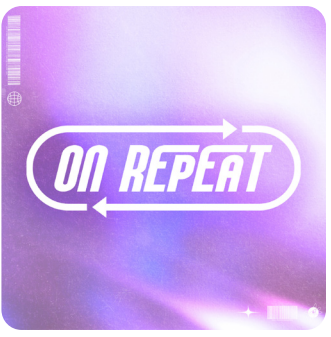
4 WEEKS ON LOVING OTHERS