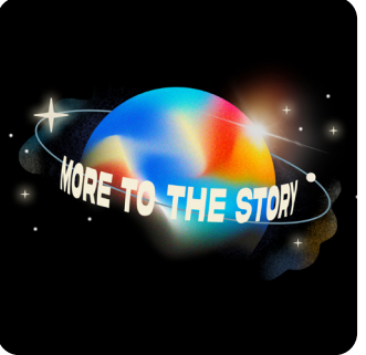
4 WEEKS ON EVANGELISM