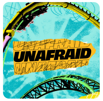
4 WEEKS ON HURT & PAIN